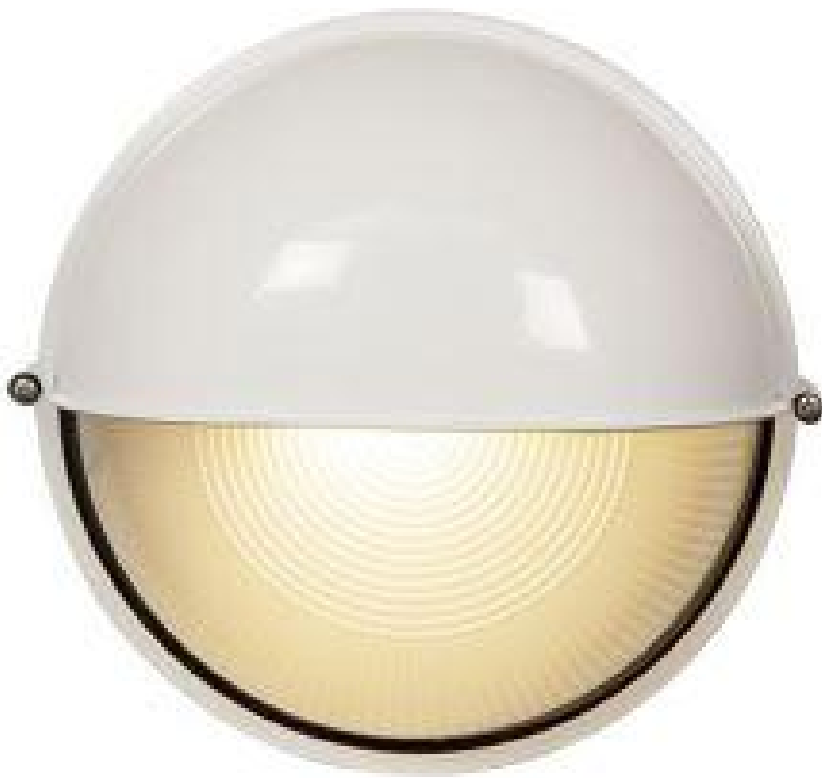
Wall mount luminaire